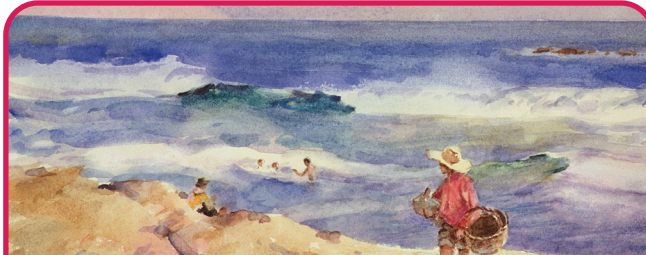
Joaquin Sorolla A painter from Spain, who painted portraits and landscapes.