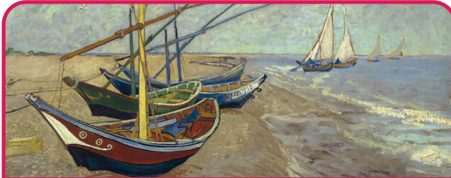
Vincent Van Gogh One of the most famous post-impressionist painters. He was from the Netherlands.