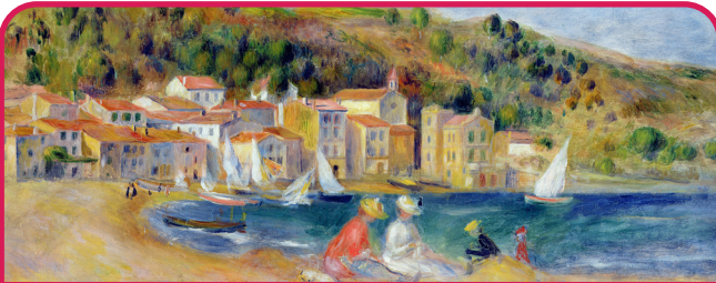
Auguste Renoir An artist from France who was a leading painter in the development of the Impressionist style.