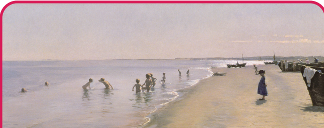
Peder Severin Kroyer A painter from Denmark.